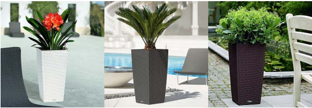
Above: These self-watering resin planters are great for poolside accents and backyard decks. They come equipped with a self-watering system that gives your plant just the right amount of water and nutrients it needs for healthy growth. Made of woven plastic resin that resembles wicker, the planters are lightweight, UV-resistant, and weatherproof. They are available in two sizes and four colors: white, granite, mocha, and black.