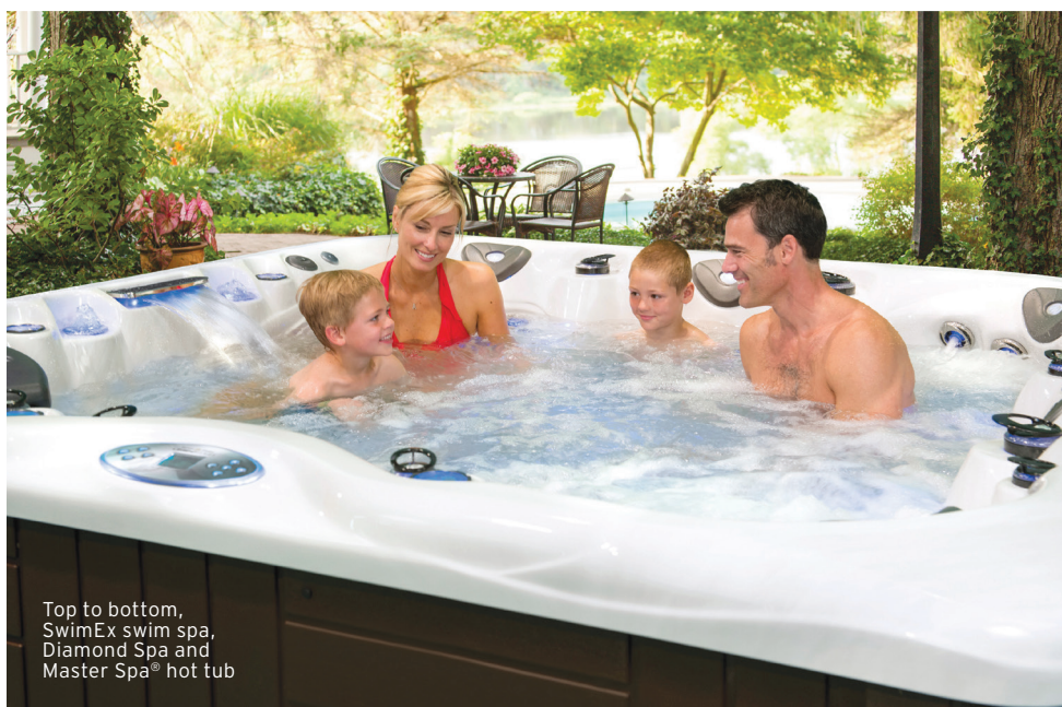
Top to bottom, SwimEx swim spa, Diamond Spa and Master Spa® hot tub